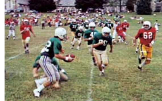
The unique history of football at Berry includes a long-running Mountain Day rivalry between the Georgian and Syrreb campus literary societies (seen here in the 1972 Cabin Log).

We have joined the right team, a fact that was underscored in early December when two very highly regarded academic institutions were accepted as affiliate members of the SAA, competing in football only, beginning in 2015. The new colleagues in Berry's conference are the University of Chicago and Washington University at St. Louis. I hope to see you here in 2015 when Berry hosts one of those renowned institutions on our campus!